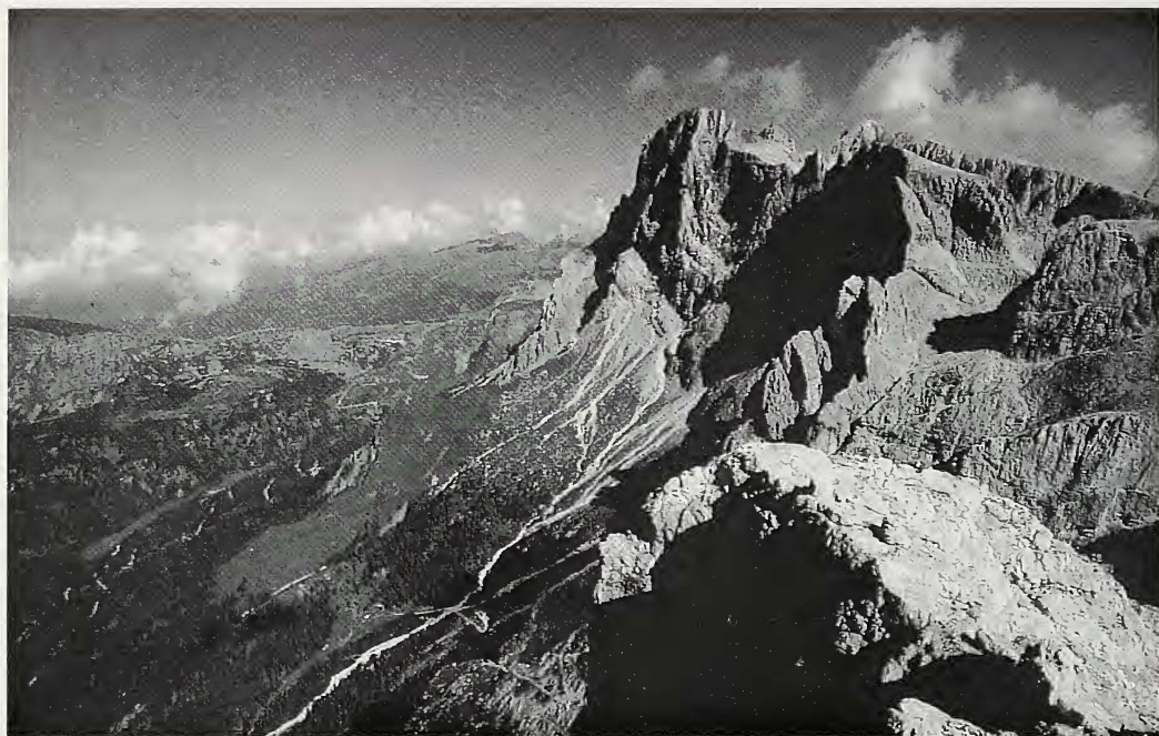
Figure 2.—Typical landscape of the Dolomites in the vicinity of Passo Rolle (RO). Alpine grasslands and subalpine woodlands sampled are visible on the left side of the photo, nival habitats on the right side.

placed a few meters apart from each other in each habitat. Altogether 15 sites were sampled by 60 traps. The traps remained in the area throughout a whole year and were emptied in intervals of 3–4 weeks during the vegetation period. In the Puez area sampling was carried out from Spring 1995 to Spring 1996, in the other areas from Spring 1997 to Spring 1998. For details about the traps see Zingerle (1997). The mean number of specimens per trap, number of species, diversity value ( ^2\log ) according to Shannon-Weaver and family composition are given for each site.